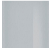
Specchio extralight Extralight mirror