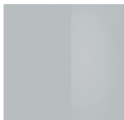
Acciaio inox lucido Bright stainless steel