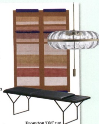
From top 'OM' rug for CC-Tapis; 'Jolie' pendant light for Gallotti & Radice; 'Uma' bench for Lema