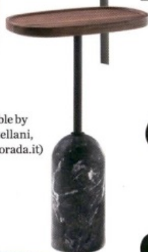
'Ekero' side table by Tollgard & Castellani, £1,452, Porada (porada.it)