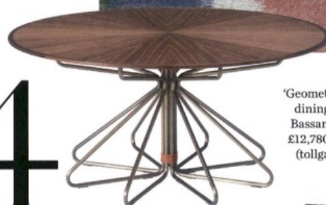
'Geometric' walnut dining table by BassamFellows, £12,780, Tollgard (tollgard.com)