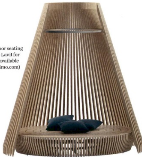
'Hut' outdoor seating by Marco Lavit for Ethimo, available 2021 (ethimo.com)