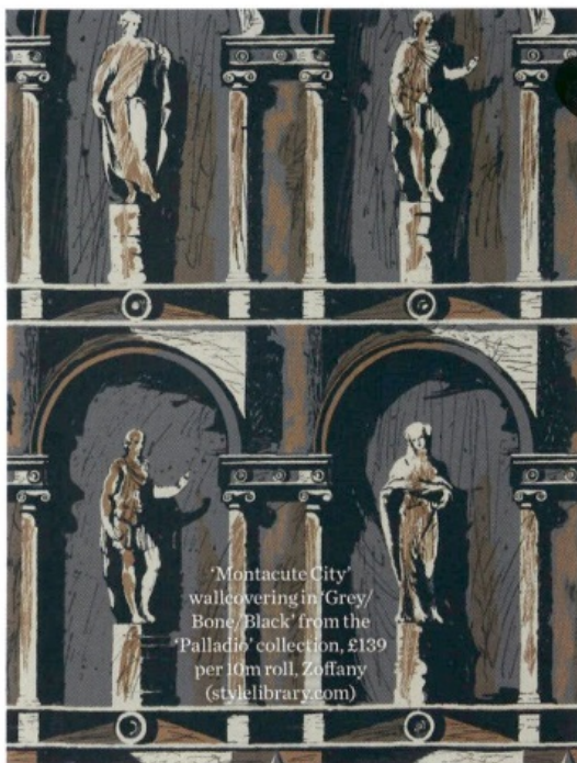
'Montacute City' wallcovering in 'Grey/ Bone, Black' from the 'Palladio' collection, £139 per 10m roll, Zoffany (stylelibrary.com)