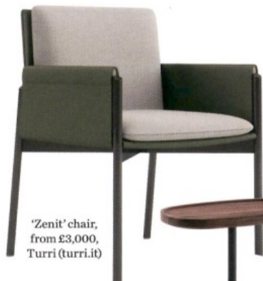
'Zenit' chair, from £3,000, Turri (turri.it)