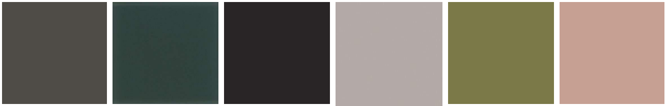
Satin dark grey