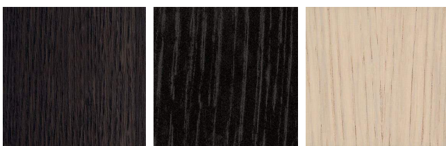
Tobacco stained oak