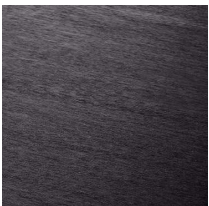
Black brushed aluminium