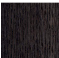
Tobacco stained ash