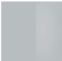
Bright stainless steel "supermirror"